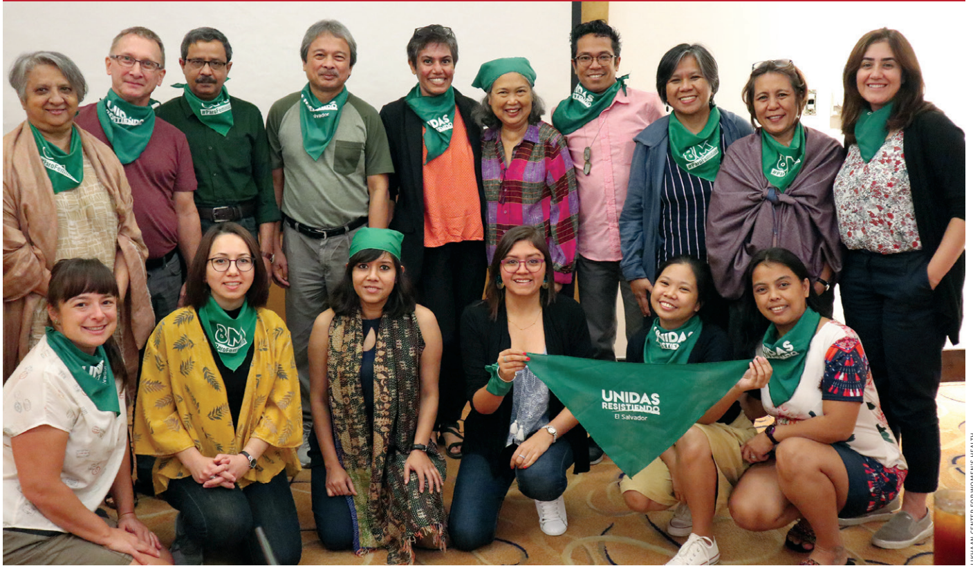
LIKHAAN CENTER FOR WOMEN'S HEALTH