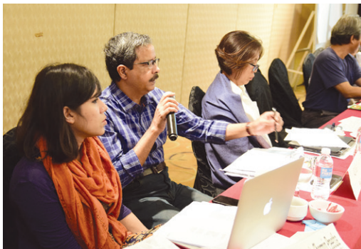
LIKHAAN CENTER FOR WOMEN'S HEALTH

Counterparts collaborated together to develop a plan for Building Momentum .