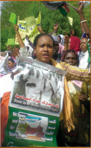
GENDER CENTER FOR RESEARCH AND TRAINING