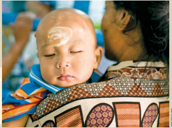
MAE TAO CLINIC

RECENT ACCOMPLISHMENT With funding from Global Affairs Canada, Inter Pares works with local partners that are providing health services to over 400,000 people in conflict-affected communities in Burma. In 2016, our partners trained 836 new birth attendants and community health workers.