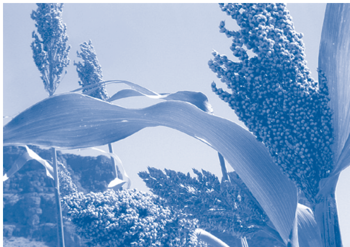
Sorghum, a staple crop in Mali.

2008 marks the 30th anniversary of the People’s Food Commission, an unprecedented civic process that unfolded across Canada. The Commission was launched in 1978 at a time when, like today, fuel and food costs were rising dramatically, and farmers were going out of business. The Commission visited 75 communities across the country,