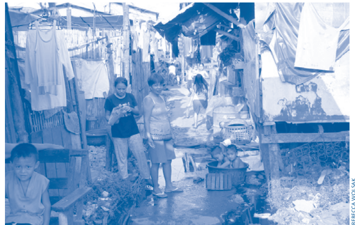
Street scene in Paradise, Manila.

Spilling out of the waiting room library, eighteen of us sat and shared stories. There was laughter and nodding as