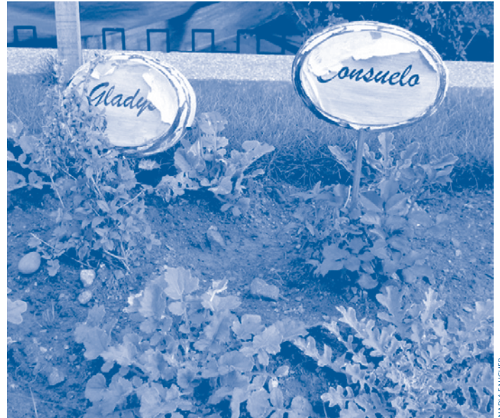
Garden in Huancavelica, Peru commemorating the women survivors of sexual violence.

In Peru, when DEMUS began providing legal and psychosocial accompaniment to indigenous women affected by sexual violence, they recognized the limitations of western counselling approaches in which they had been trained. Many indigenous communities in the Andean region do not have a concept of mental health, but a concept of physical and social health. Allin kausay , a Quechua term loosely translated as “living well”, is what indigenous women in the community of Manta referred to when describing what was now missing in their lives. Allin kausay is the equilibrium between a series of elements, thoughts, emotions, work,